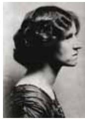
Malting House School and Susan Isaacs

1924, Susan Isaacs (1885-1952) started teaching at the new Malting House School, Cambridgeshire. Influenced by Dewey and Piaget's theories, she facilitated real-life learning journeys with much outdoor play, concerned with 'the meaning of the child's experiences to himself'. Isaacs was supremely qualified in observation as an experienced psychoanalyst and remarkable polymath. FS practitioners don't need to train to her standards yet her work highlights the importance of close observation and documentation. There is a need for practitioners to know how to observe and increase their sensitivity of response, reflecting on practice to identify where skills can be improved and scaffold when needed.