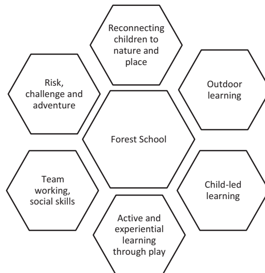
FIGURE 1 Situating forest school among contemporary movements in education and child development.

An initial pilot study of forest school was carried out to familiarise the researcher with forest school sessions. This involved observing 72 children of primary school age who each attended five to six weekly sessions in groups of 12 (six cohorts of approximately 12 children, each attending forest school for half a term, 34 sessions observed in total). Participant observation and subsequent analysis of notes regarding each cohort, and again when all cohorts had been completed, identified research themes to be explored in further detail: What were children learning at forest school? How did the outdoor learning space influence the sessions? How did children respond to the sessions? This paper focuses specifically on the second question concerning the outdoor learning space. The emerging research questions all required further investigation and scaling up the findings to encompass a greater number of children and sessions.