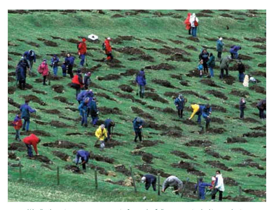
Woodland creation creates an opportunity for people of all ages to get involved in tree planting and to play a part in their local environment.

We do not create woodland on valuable semi-natural habitats, such as unimproved grassland. Where appropriate we will create other habitats, such as wetlands and ponds, to reflect the local landscape and increase the opportunities for wildlife.