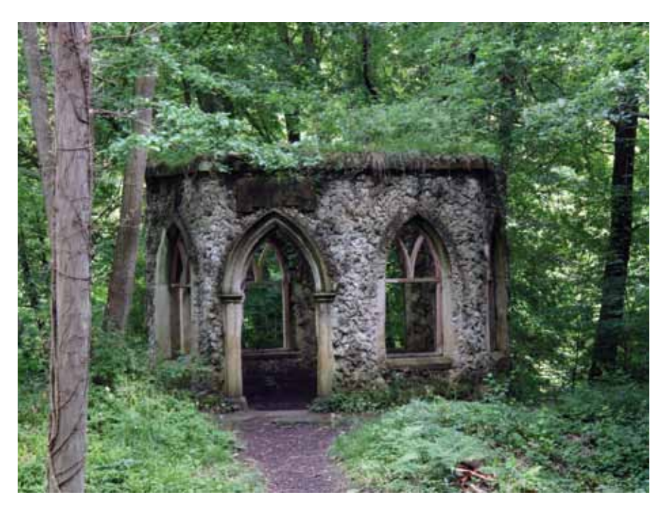
Woods often contain important archaeological features.

We aim to protect these features and, where appropriate provide interpretation which can add to the experience of the woodland for visitors. Management may involve the removal of trees in order to help preserve below ground archaeological interest or reveal the feature more fully, such as ancient hill forts, or nationally important structures such as Offa's dyke. Very occasionally it involves major works to conserve buildings such as ice-houses, follies and historical crofts.