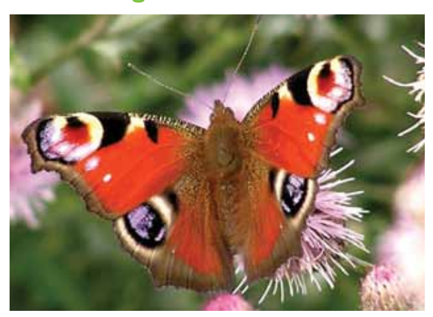
Sheltered and sunny woodland glades and rides can be important for butterflies, attracted to flowering plants once more widespread in the countryside.

The open ground represented by woodland rides and glades in woods are an important habitat supporting a diverse range of wildlife. They are often vital for species which at one time were found more frequently in the wider countryside when unimproved grassland and shrub habitats were more common. They also provide a focus for visitors to enjoy the associated wildflowers. butterflies and bats. We aim to restore and maintain existing rides and glades and, where appropriate, create new ones to enhance biodiversity and enjoyment for visitors.