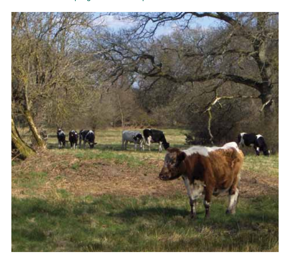
Grazing cattle can be an important management tool to maintain valuable open ground habitats.

Where semi-natural open ground habitats have been encroached or planted with woodland, we restore them to open ground where it is practical and can be sustained.