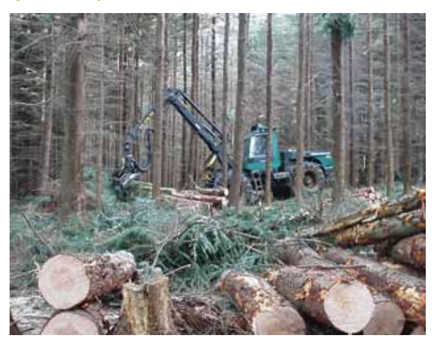
The gradual removal of conifers from PAWS woodland allows remnant ancient woodland communities to recover.

Plantations on ancient woodland sites are ancient woods that have been planted with nonnative species mostly during the 20th century. However non-native conifer plantations can have a negative impact on the ecology of ancient woods, through the management to establish them and then the impacts of the dense shade they cast. Such sites can lose much of their ancient woodland flora and fauna. However. research has shown that in most PAWS site