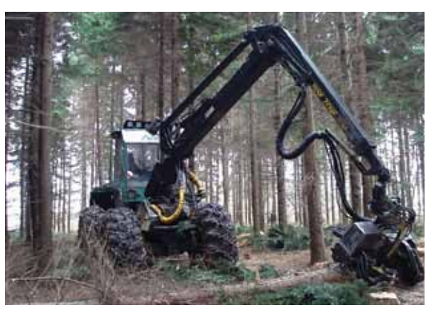
Where our sites are planted with non-native conifers, we gradually convert these to predominantly native woodland

Parts of our estate consists of non-native conifer or mixed plantations that have been established on previously open land such as arable or improved grassland sites. We gradually change these woods to predominately native woodland, while respecting local landscape or cultural aspects such as the retention of significant non-native trees.