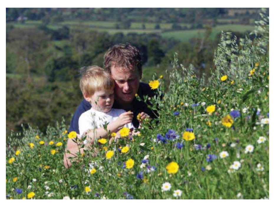
'Forest of Flowers', pioneered by the charity Landlife, has helped us to create new woods that are rich in wildlife from the start. The stunning display of flowers draws people to explore and enjoy new woodland.

Through projects such as 'Nature Detectives' we produce materials for families that could be used in any wood. The Visitwood website aims to provide information on accessible woodlands in both private and public ownership across the UK. Events and activities at our woods are advertised locally or via our website.