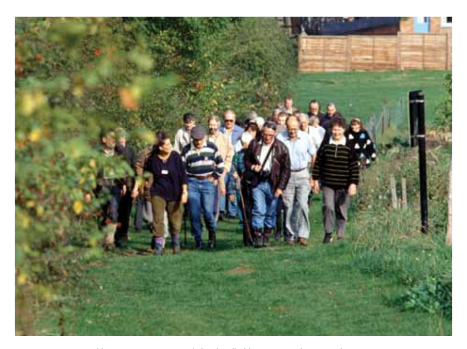
Most visitors to our woods live locally. Having a wood on your doorstep, free to enjoy is one of the great benefits of many of our sites.

Our woods provide attractive settings where visitors can explore and enjoy activities such as walking the dog, taking exercise, having a picnic, enjoying the wildlife, and providing children with opportunities for play. Most visitors to our sites live locally, and want a peaceful, informal and tranquil place to enjoy; we try to ensure that sites reflect this.