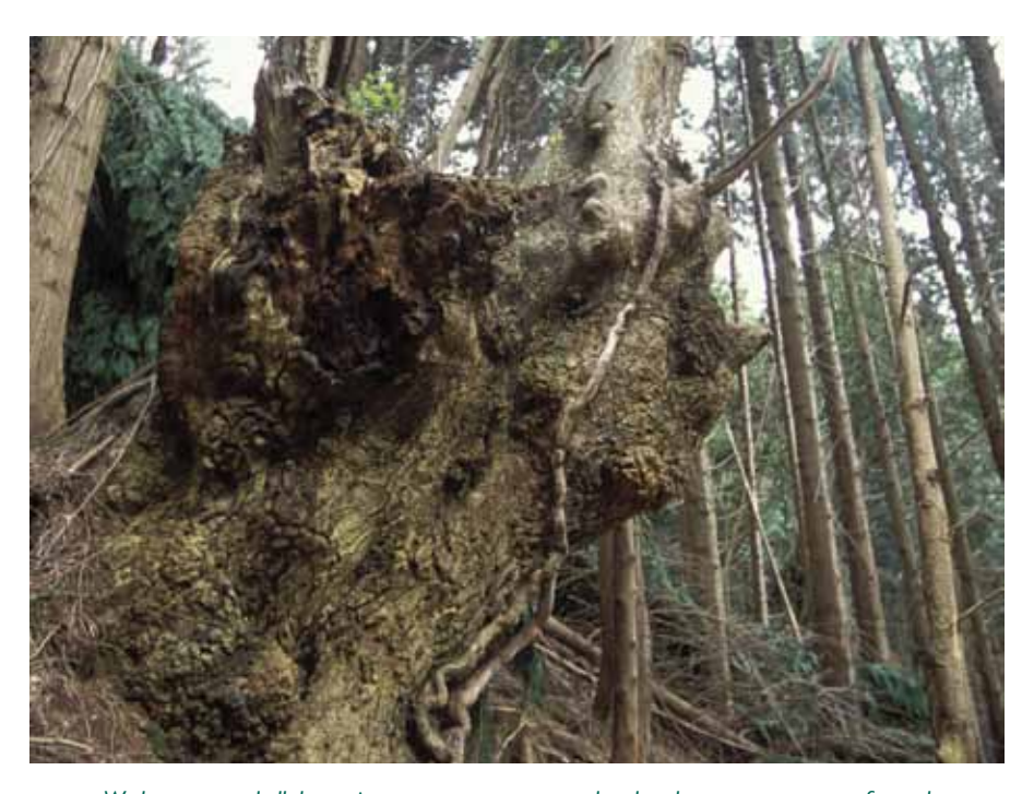
We have mapped all the ancient trees on our estate and undertake management to safeguard them and the wildlife they support

One of the key values of ancient trees is the amount and variety of deadwood that they provide which is in turn an important resource for rare fungi and insects. While seeking to minimise the risk to visitors we promote and retain as much deadwood habitat as possible in our woods for the biodiversity benefits it provides.